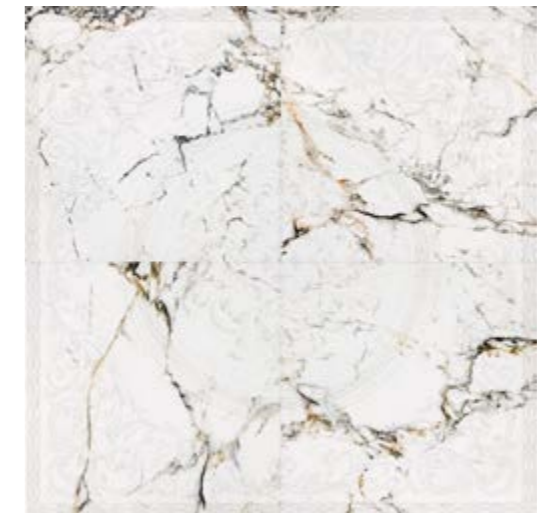
* Ros.Tucci Gold