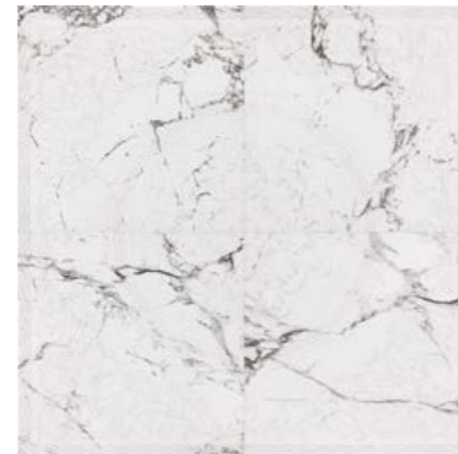
* Ros.Tucci Black