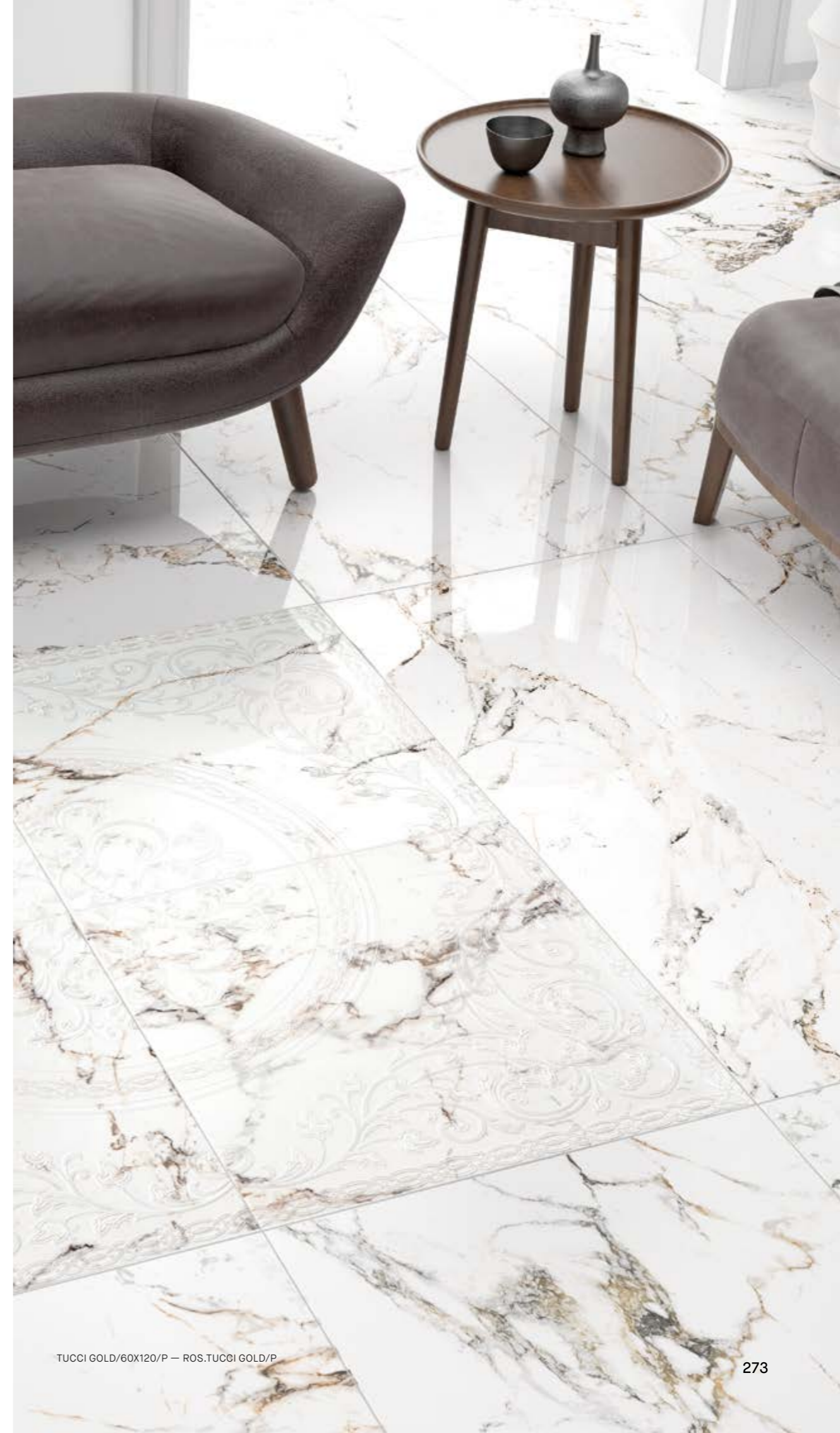
TUCCI GOLD/60X120/P – ROS.TUCCI GOLD/P